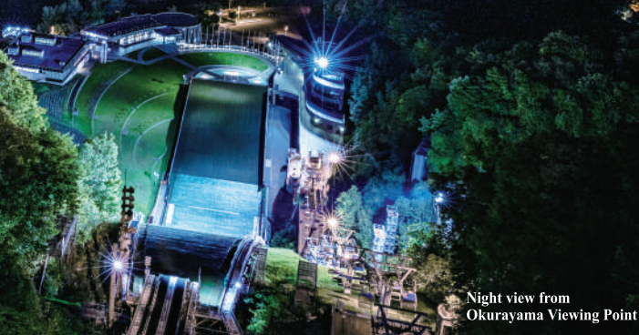
Night view from Okurayama Viewing Point